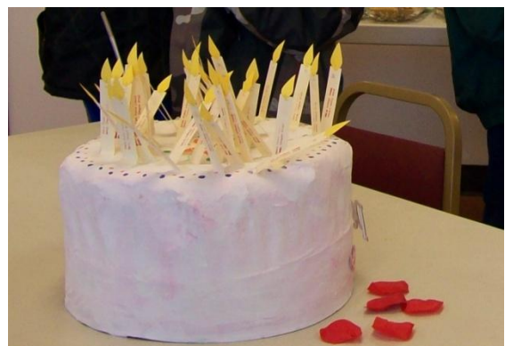
Virtual Cake with Wish Candles